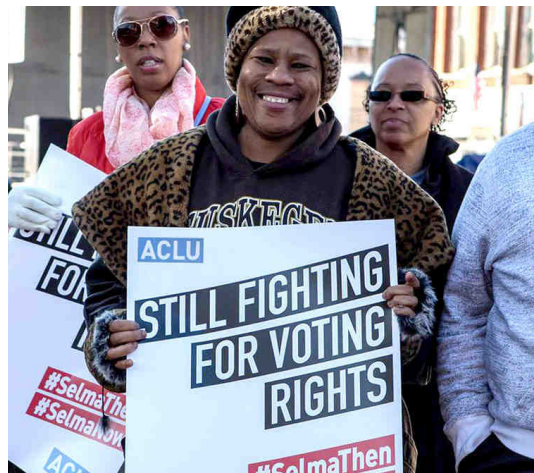
American Civil Liberties Union

The program can be delivered without slides, if a computer and projector are unavailable. Access to a white board and easels is desirable.